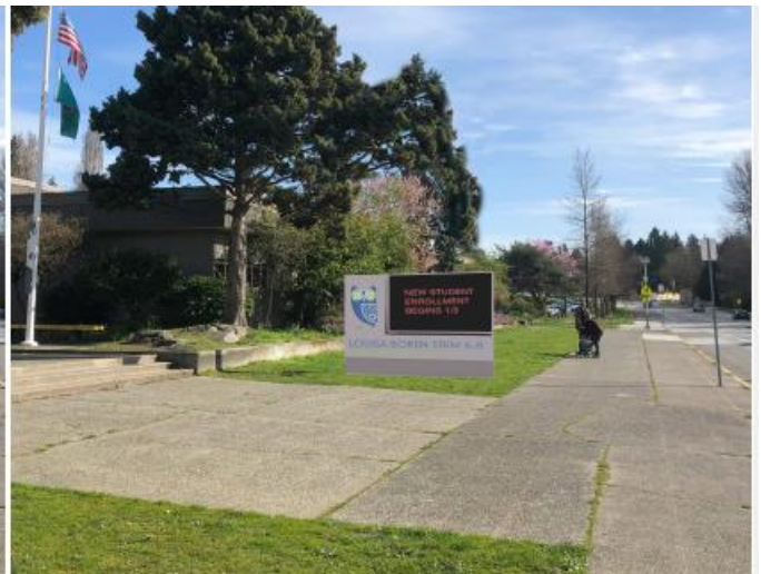
Proposed ground mounted sign with changing image message board