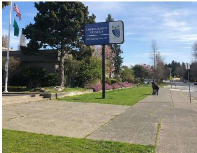
Current pole-mounted electric sign that would be demolished